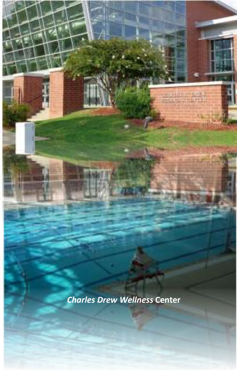
Charles Drew Wellness Center